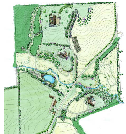
Green Master Plan

Client: Private Homeowner Location: Union County, PA